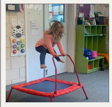
GROSS MOTOR ACTIVITIES

We provide independent play such as table top activities as well as free flow and structured group play to increase your child's social interactions in a fun environment.