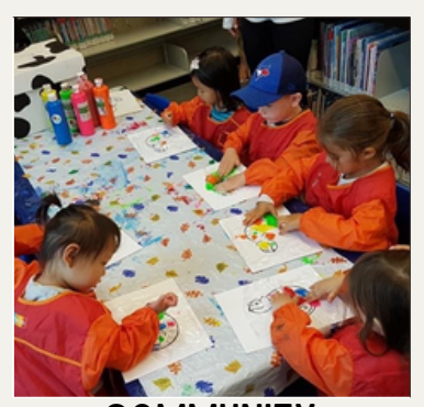
COMMUNITY FIELD TRIPS